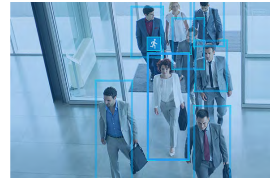
AI & Video Analytics